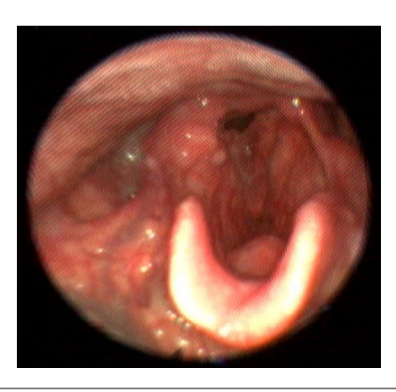
Figure 1 : Thickening of the Right Aryepiglottic Fold With a Mild Paralysis of the Right Hemilarynx

A 59-year-old male patient referred to the clinic with marked dysphonia over the last month. He denied dyspnea or throat pain. His medical history included chronic obstructive pulmonary disease secondary to tobacco consumption. He denied excessive alcohol consumption. On the fiberoptic exploration, severe Reinke edema and aryepiglottic fold thickening with slight impairment of motility in the right hemilarynx, but no lymphadenopathies, were observed (Figure 1).