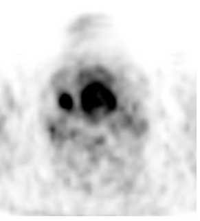
Figure 2 : CT Scan and PET Scan of the Pathology A) CT scan showing a bulging of the right supraglottic area without cartilage invasion; B) PET scan showing a mild FDG uptake at right lymph node and larynx

The stage of the tumor was a suspected T3N1M0 larvngeal neoplasm. Therefore, chemoradiation therapy was advised. The patient was programmed for 33 sessions of radiotherapy and three concomitant doses of 100 mg/m<sup>2</sup> cisplatin, but he was found dead at his home when he was about to end this treatment. The cause of the decease was a myocardial infarction. The surface of the mucosa was partially ulcerated and covered by an irregular acanthotic epithelium. The general architecture of the glands was preserved within pronounced and extensive squamous metaplasia of the salivary gland ducts and acini (Figure 3). In some instances, there was a pseudo-infiltrative pattern and slight inflammation in the surrounding tissue. Some ducts were dilated within mucous or necrotic debris. Immunohistochemistry analysis pointed flattened basal cells at the periphery of epithelial islands; P53 test result was negative (Figure 4).